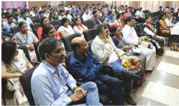
Audience for the Debate