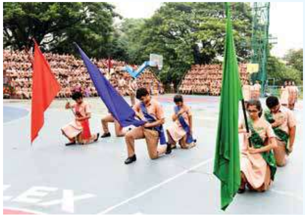
Leaders take oath