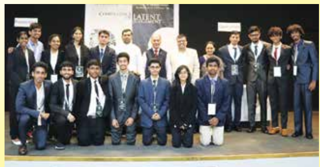
The Student Council - Organising Committee