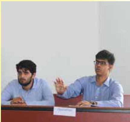
Participants at the Debate