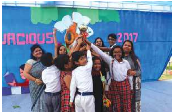
Winner Grammar Wiz