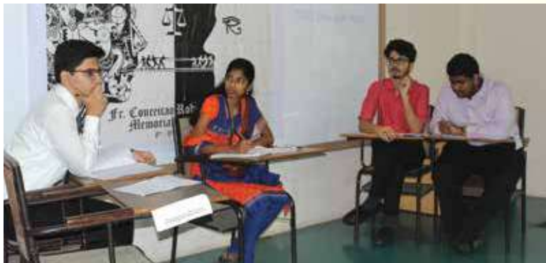
Round 1 Debate in the Seminar Hall