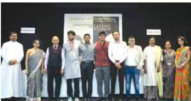
The committee of Teachers and dignitaries