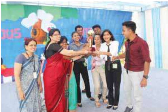
Winner Be a Commentator